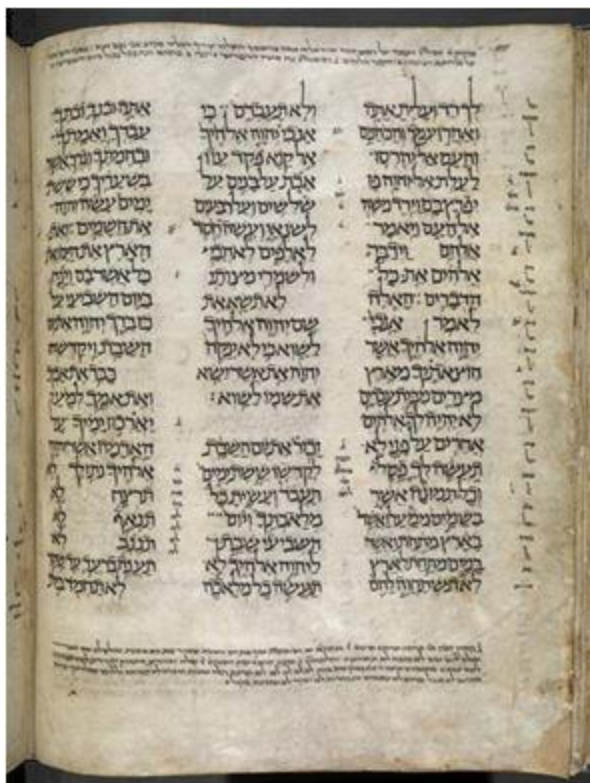
Massoretic Text of the Ten Commandments

The Massorites gathered up as many of the various Hebrew manuscripts as they could find in order to do their work, but we must keep in mind that they were working from copies of copies . . . they did not have access to the "original" texts since those texts no longer existed. As they were doing their work, if they discovered an 'error' in the text, or felt the need to change the text for some reason, they faithfully copied the text of the "original", but noted in the margins of the copy what they believed to be the 'correct' reading. These marginal notes are what is called the "massorah". Besides their changes, it's becoming more and more clear (as evidenced by recent discoveries) that there were changes or errors in the text from which they were copying (i.e. - earlier copies of the 'originals') that they were either unaware of, or that they chose not to correct -