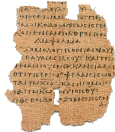
Septuagint 4th Century BCE Psalm 89:4-7

There are a number of legends, but few facts available as to its creation. The common thread is that there was a clear need for a Greek language version of the Hebrew scriptures in and around the area of Alexandria, Egypt where many Jewish people had settled after the Babylonian captivity. After this area was conquered by Alexander the Great, the Greek language became wide-spread and eventually the Jewish people began to use Greek as their primary language. Because of the 300+ year influence of the Greek culture on the Holy Land, the LXX became widely accepted by the first century Jewish people, and as we’ve already seen, was used by, and had apparently become the preferred source of OT quotes by the NT writers.